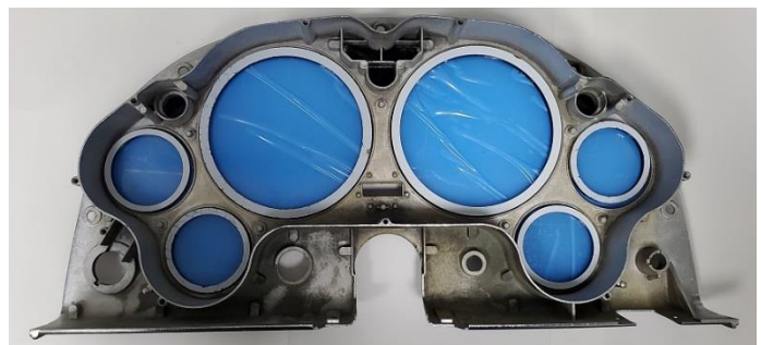
Place spacer on top of lens