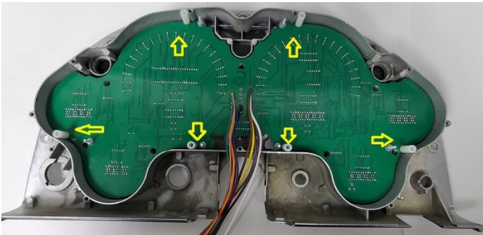
After attaching lens to Dash panel place Spacers equally spaced.