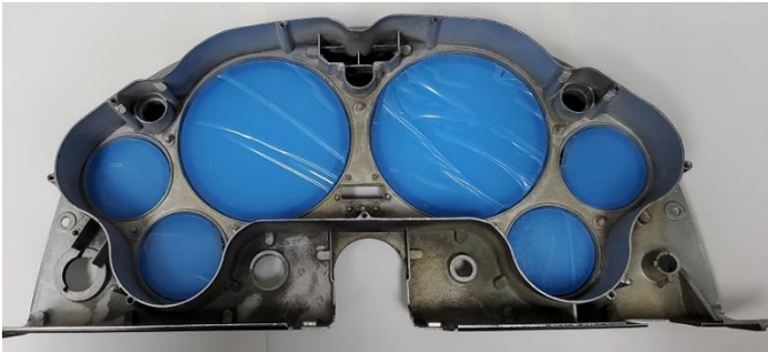
Place clear lens in hole