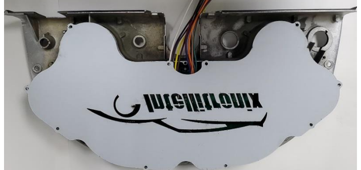
Place rear cover on to hold everything together Use original screws to hold down.